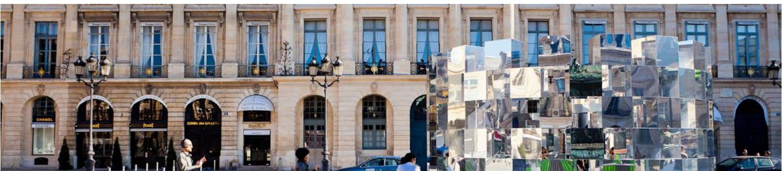
Location: Place Vendôme, Paris.