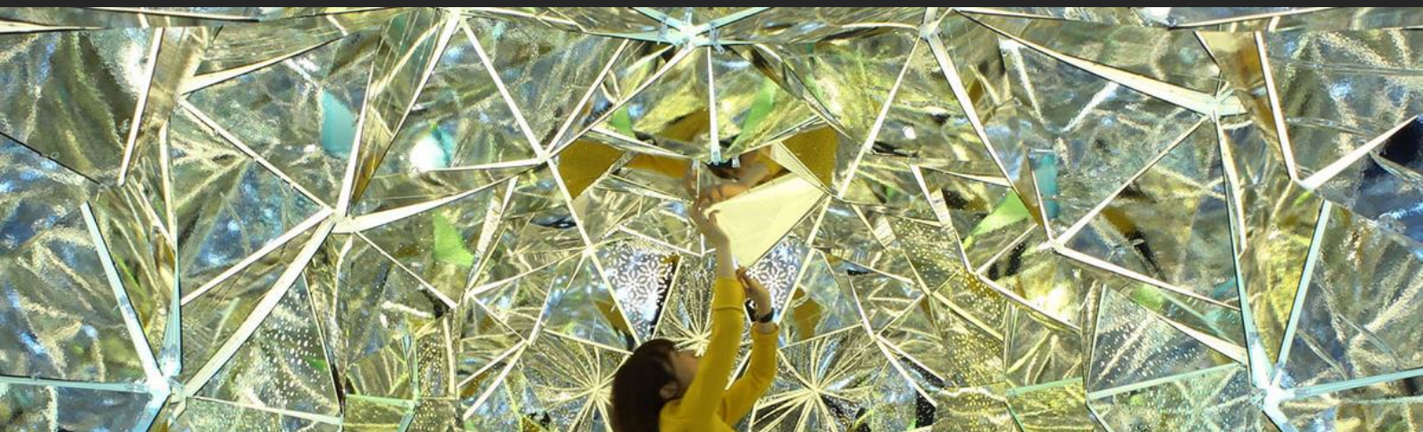
Designers © Masakazu Shirane and © Saya Miyazaki | Wink Space - an Immersive Kaleidoscopic Mirror Tunnel Inside a Shipping Container